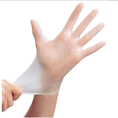
Vinyl Gloves 100's (S,M,L)