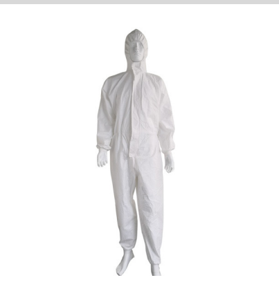
Disposable Protective Cover all