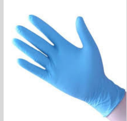
Nitrile Gloves, 100's