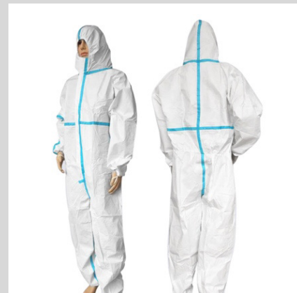
Disposable Protective Coverall