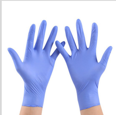
Latex Gloves 100's (S,M,L)