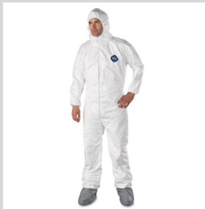
DuPont Tyvek Disposable Coverall