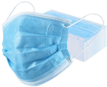
Disposable Face Mask, 50's